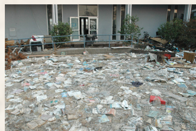
Flood damage