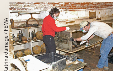
Katrina damage

Think about connecting with other cultural heritage organizations in your community. But if you haven't established a relationship with other local organizations, exchanging business cards in the aftermath of a disaster is too late. Turn to COSTEP MA to provide guidance and assistance.