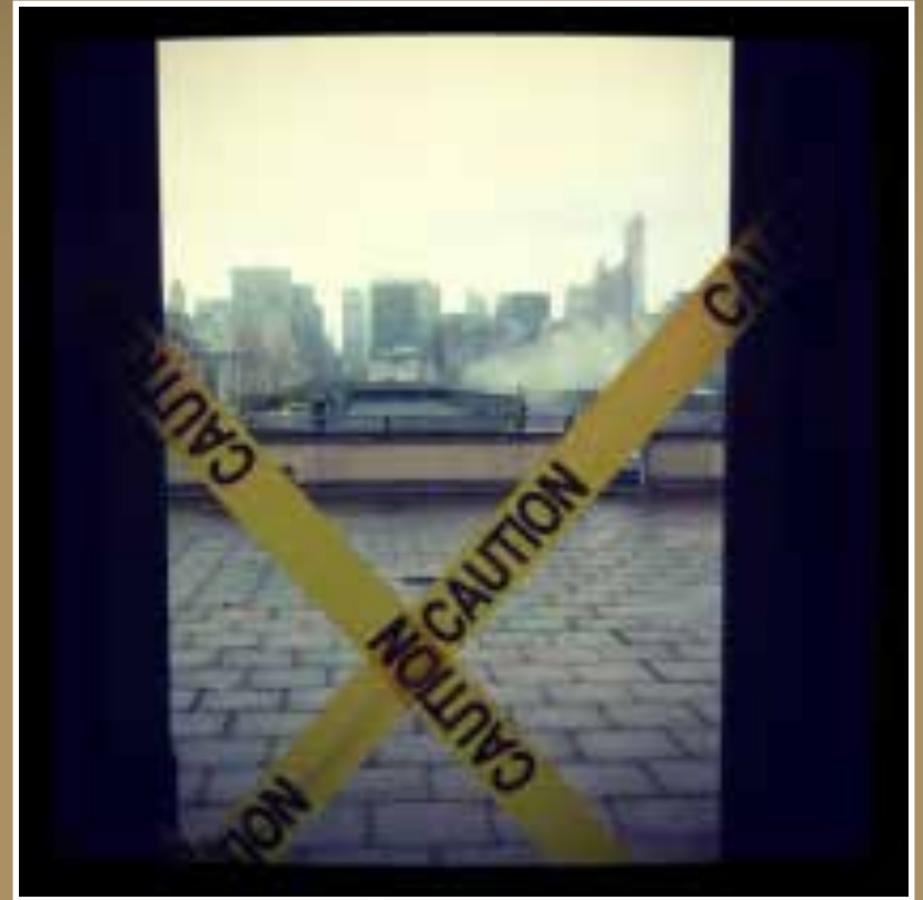
Locked doors and taped windows at the MMA