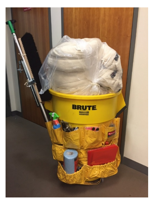
50 Gallon Trashcan with Emergency Supplies