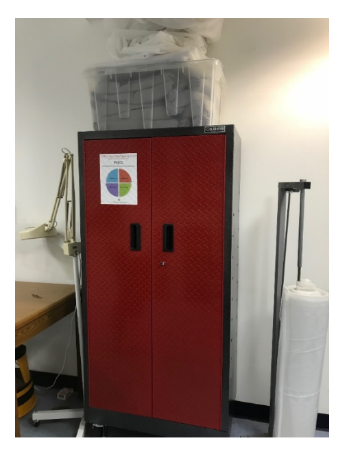
Large Metal Container with Emergency Supplies