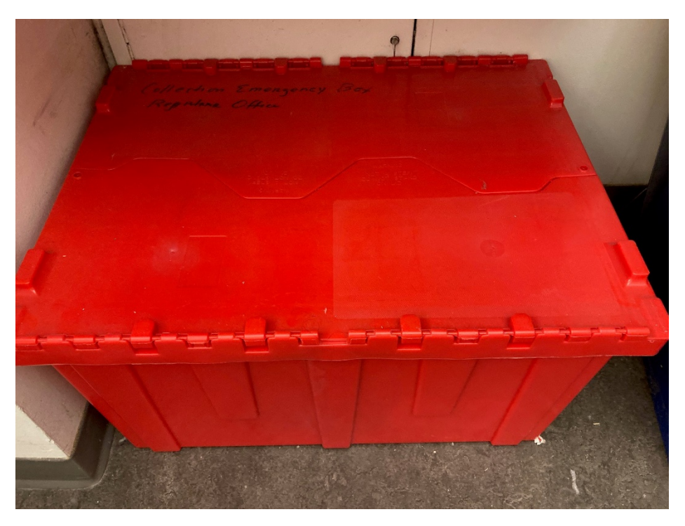
Plastic Storage Bin for Emergency Supply Storage