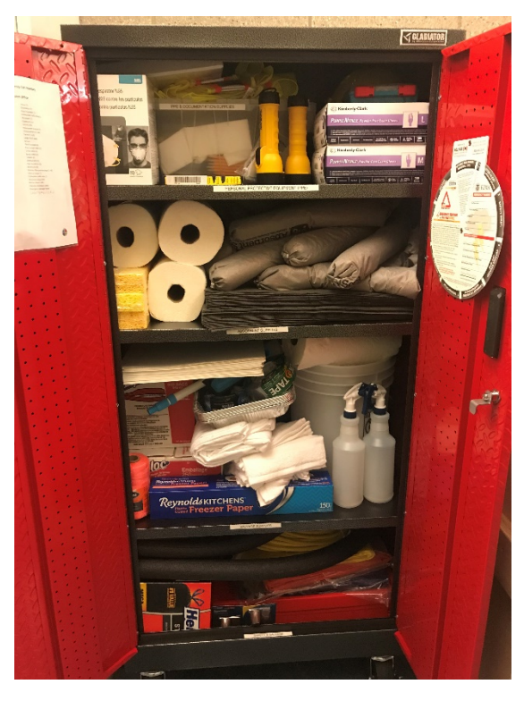
Interior of Large Emergency Supply Container

Inventories of each kit should be kept and updated regularly on a secured and shared digital platform. They should also be printed out and placed inside the kit for quick reference sharing during an emergency.