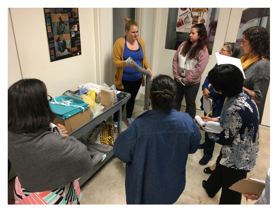
Staff Being Trained on How to Use Supplies in Emergency Kit

Staff should be trained regularly on the location of all the kits and supplies. This can be accomplished by facilitating consistent walkthroughs of all the kit locations for new hires and when re-freshers are needed. Staff should also be trained on how to use the supplies inside the carts. Buying some extra supplies for table-top exercises or scenario-based learning can make staff much more comfortable and use resources wisely if trained before an incident occurs.