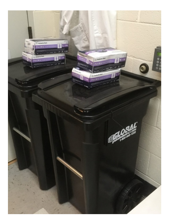
160 L Trash Cans Filled with Emergency Supplies