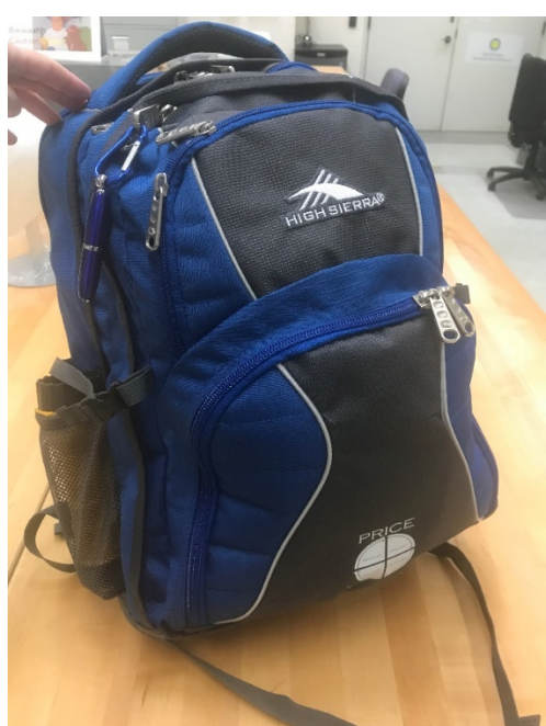
Go-Bag of Emergency Supplies