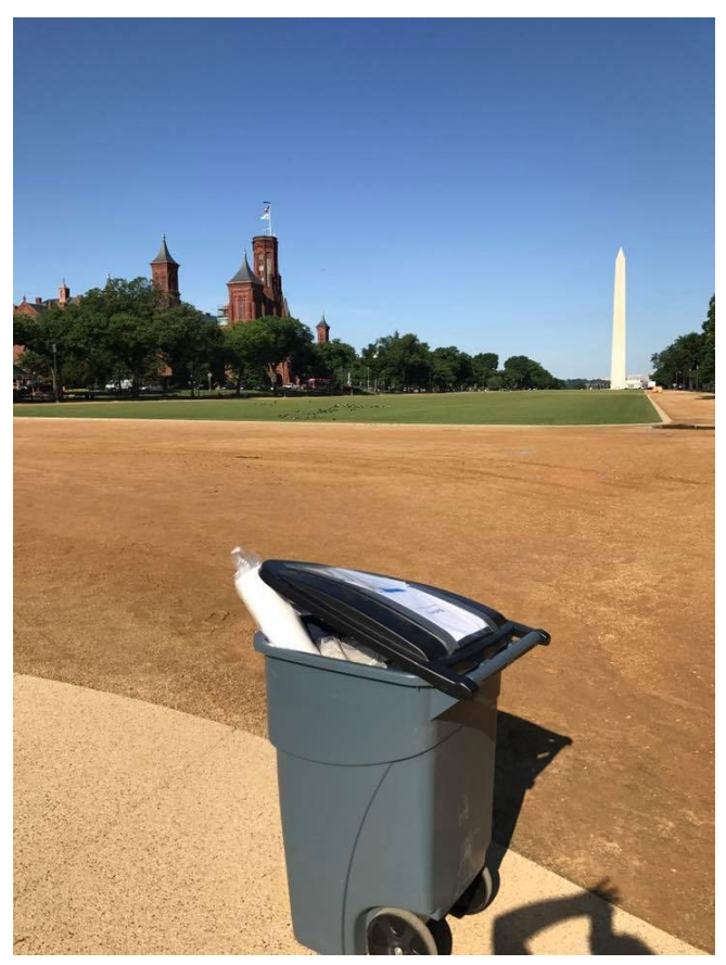
Portable Emergency Kit on National Mall

As with all emergency planning and preparedness, emergency supplies and documents pertaining to them in Emergency Plans should be when changes are made to the supplies or minimally, on an annual basis.